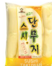
MD4002 초)스시단무지 (백)