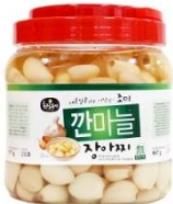
MC1991 초)조미간마늘 장아치(통)