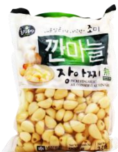
MC2002 초)조미간마늘 (팩)