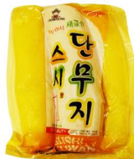
MD4001 초)스시단무지 (황)