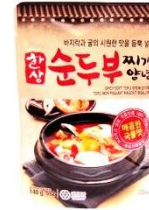
EH9302 한상)순두부찌개 양념(싱글)