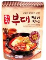
EH9303 한상)부대찌개양념 (싱글)