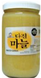
EC2054 초)다진마늘 CRD)MINCED GARLIC 12/32OZ(2LB)