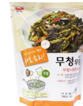
EI0002 일가집)무청무침(무청+소스) IGJ)SEASONED RADISH LEAVES WITH SAUCE 8/10.23oz(290g)