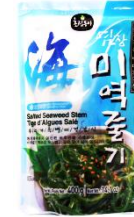
HC1042 초)염장미역줄기 CRD)SALTED SEAWEED STEM 20/400G