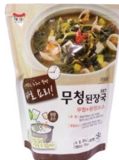
EI0001 일가집)무청된장국(무청+소스) IGJ)SEASONED RADISH LEAVES BEAN PASTE SOUP WITH SAUCE 8/11.29oz(320g)