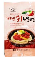
EK1003 KTOWN) 비빔회냉면