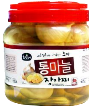
MC1992 초)통마늘장아찌 (통)