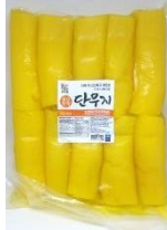
MS4009 송죽원)점보토막단무지(통) SJW)YELLOW PICKED RADISH(WHOLE) 4/6.6LB(3KG)