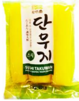
MS4003 송죽원)스시단무지(황) SJW)YELLOW PICKED RADISH 14/2.2LB(1KG)