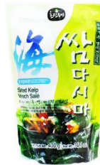
HC1041 초)쌈다시마 CRD)SALTED KELP 20/400G