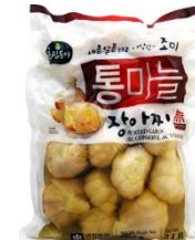
MC2001 초)통마늘장아찌 (팩)