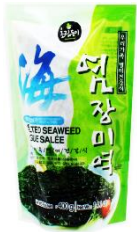
HM0050 초)염장미역 CRD)SALTED SEAWEED 20/400G