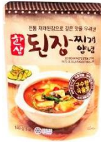
EH9301 한상)된장찌개양념 (싱글)